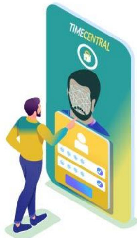
Face Recognition attendance