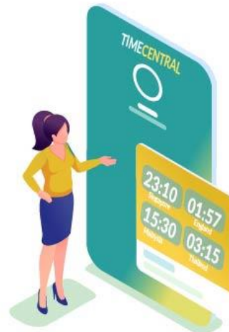
Multi-Location / Time zone