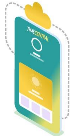
Real-time push to cloud